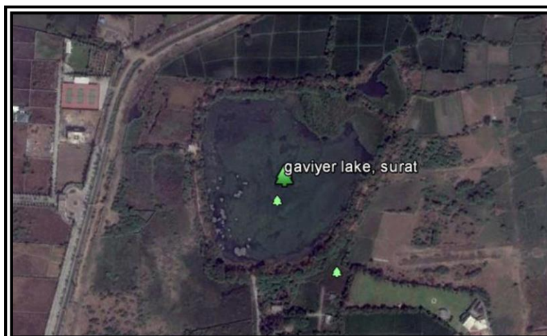
Fig: 1 Google satellite image of Gaviyer lake, Surat district, Gujarat